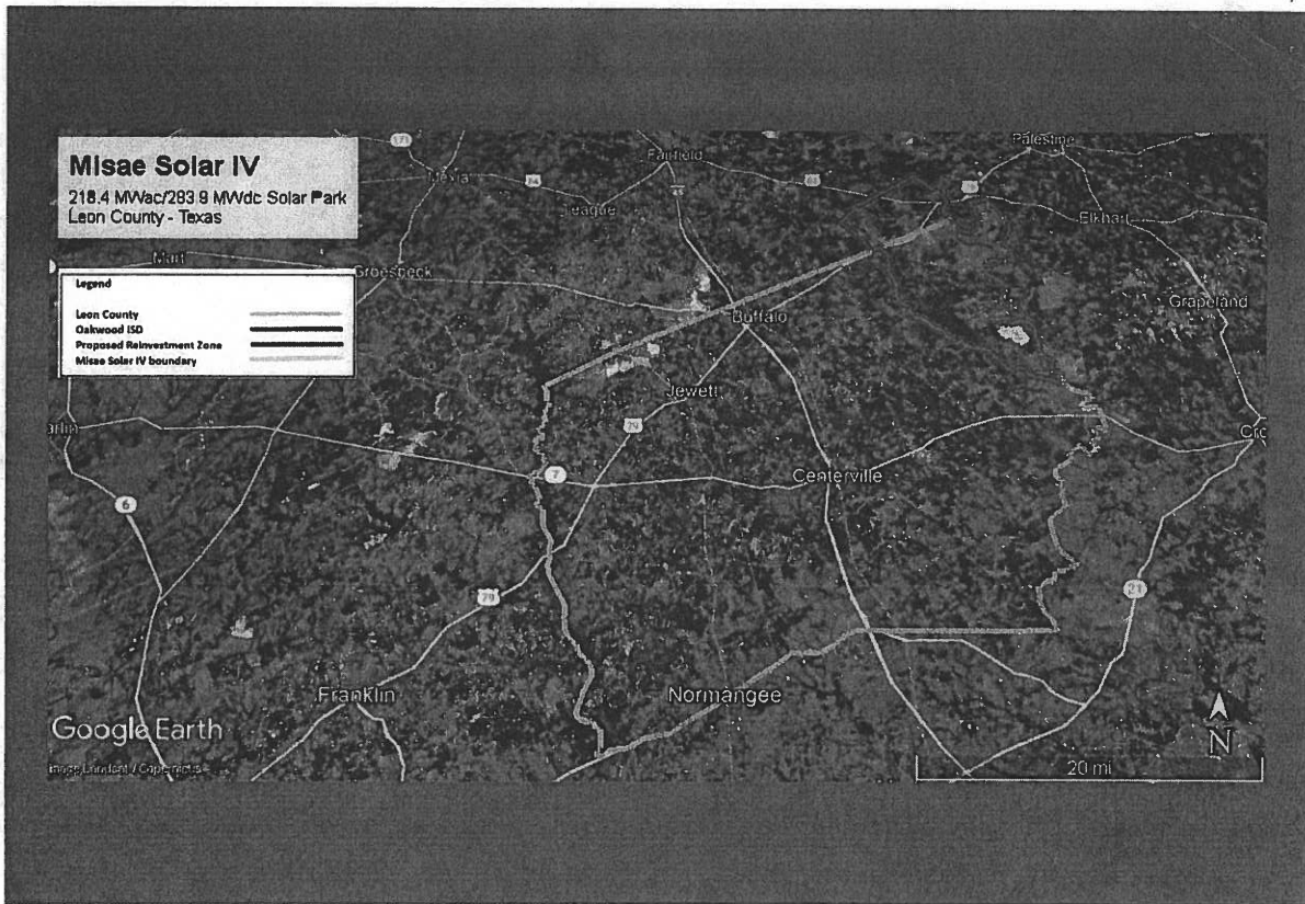
EXHIBIT A (CONTINUED) MAP OF MISAE SOLAR IV REINVESTMENT ZONE